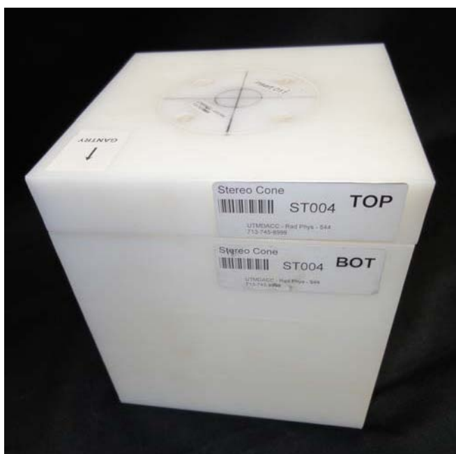
Figure 2: Assembled SRS Single-Beam verification system